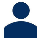
Single licensing (no managing broker)