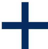
Status quo role within an enhanced regulatory framework

Looking to the future of real estate regulation, there may be opportunities to articulate a new concept of the managing broker and re-align the regulatory framework, including where liability is assigned. The three concepts for the future of the role of managing brokers that were presented are: